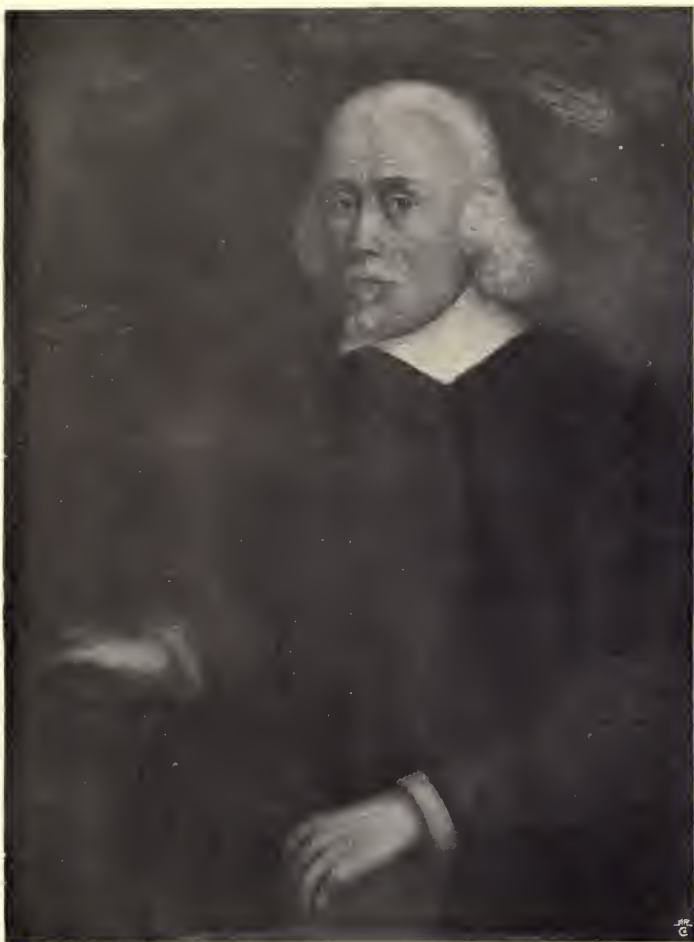
WILLIAM HARVEY, M.D., 1578-1657.